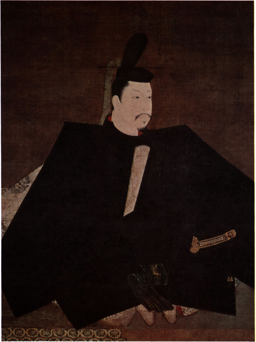
Portrait of Minamoto Yoritomo. (Jingoji Temple, Kyoto)