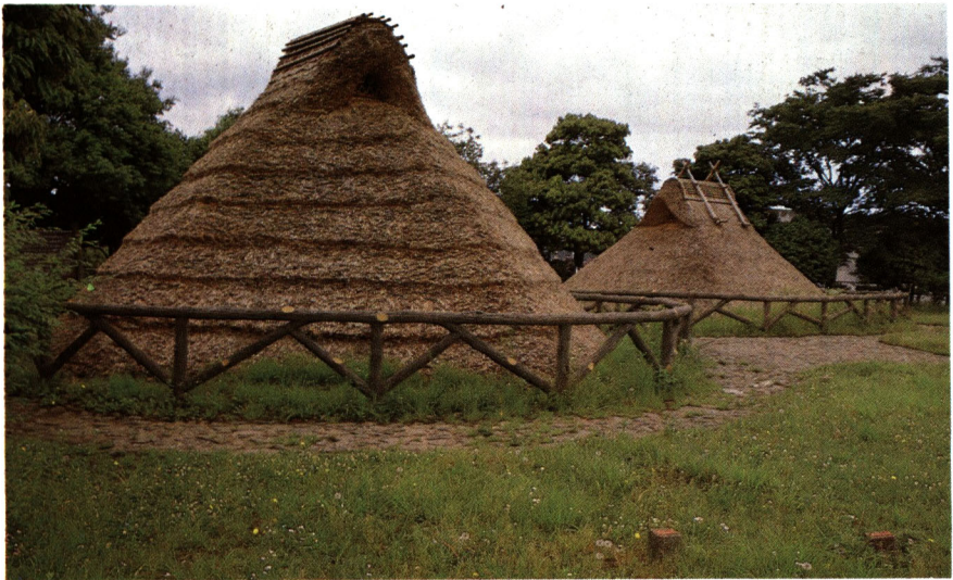
Reconstructed Yayoi-period pit dwellings. (Santonodai Archaeological Museum, Yokohama City)