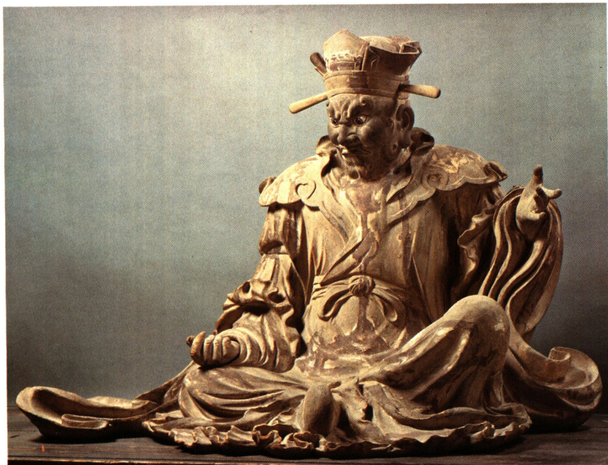
Kamakura Period image of the Buddhist deity Shokōō.(Ennōji Temple, Kamakura City)