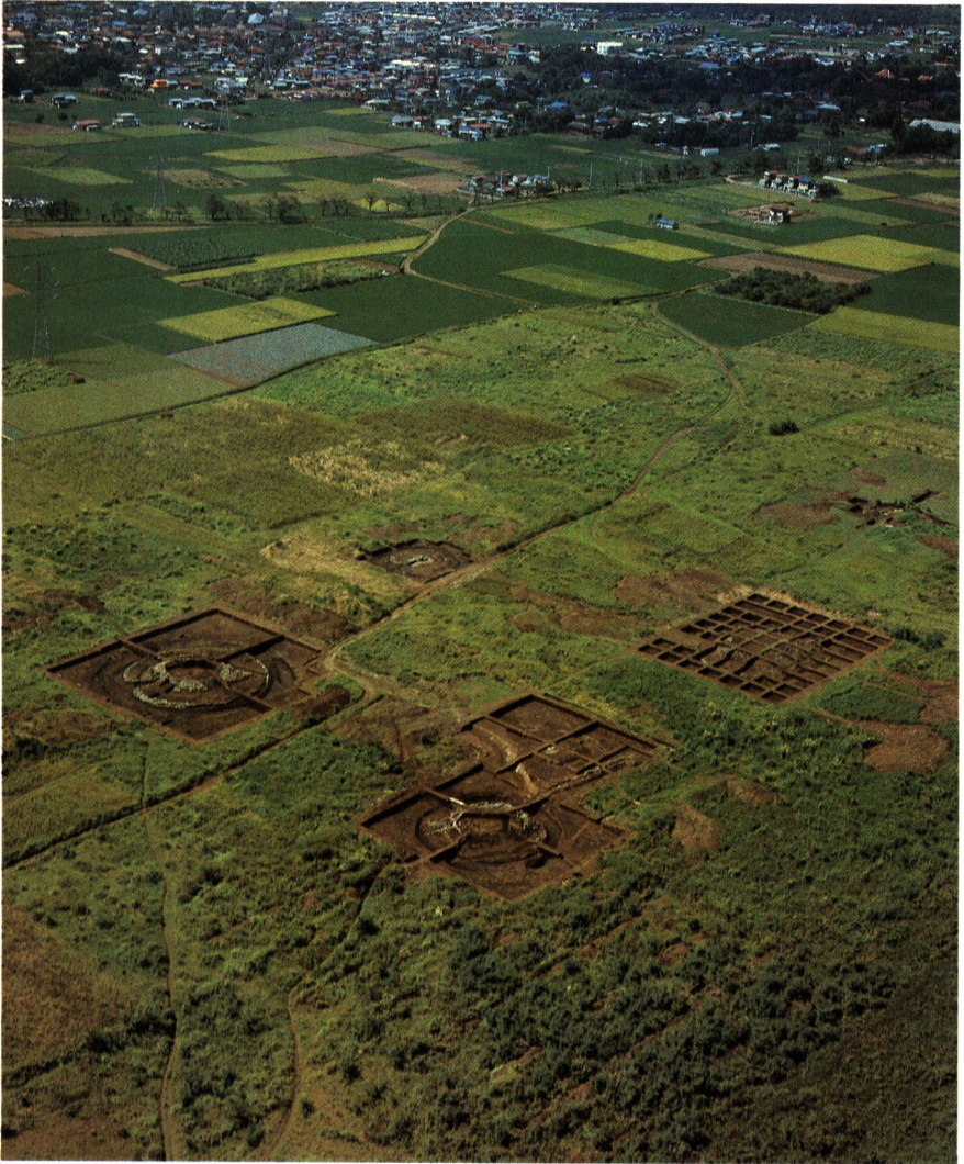
Group of tumuli at the Sakuradote site in Hadano City.