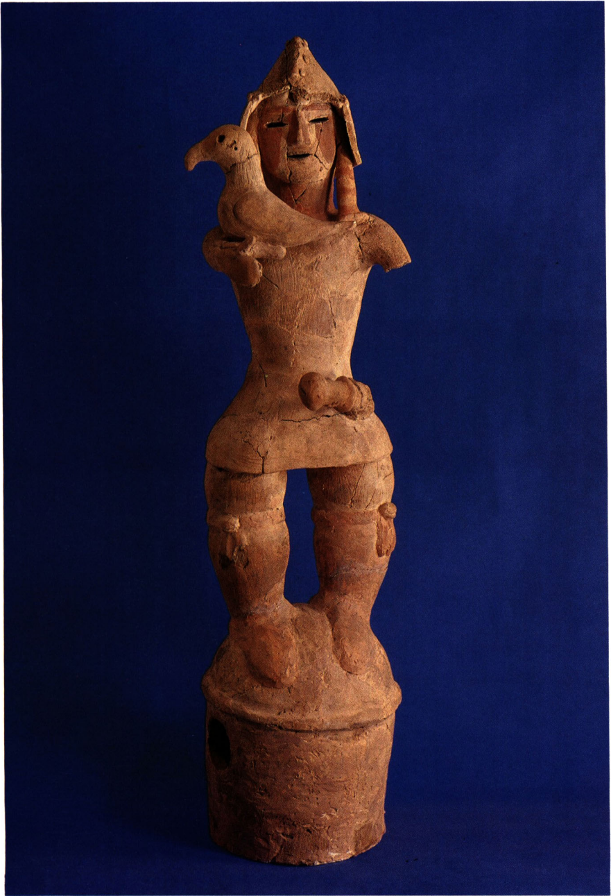
Haniwa sculpture of a warrior (height 90 cm) from the Dōyama tumulus in Atsugi City. (Atsugi Board of Education)