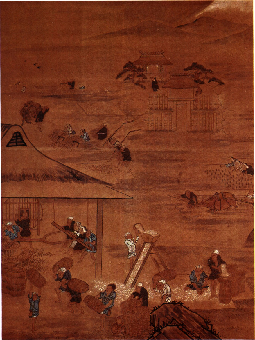
Genre painting depicting agricultural activity throughout the four seasons, offering a glimpse of pastoral life in Sagami during the late Edo period. (Collection of Moriya Matsusaburō, Ōiso Township)