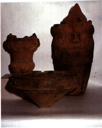
Katsusaka-style Jōmon pottery. Used as a storage jar or for boiling food. (Kanagawa Prefecture Archaeological Center)