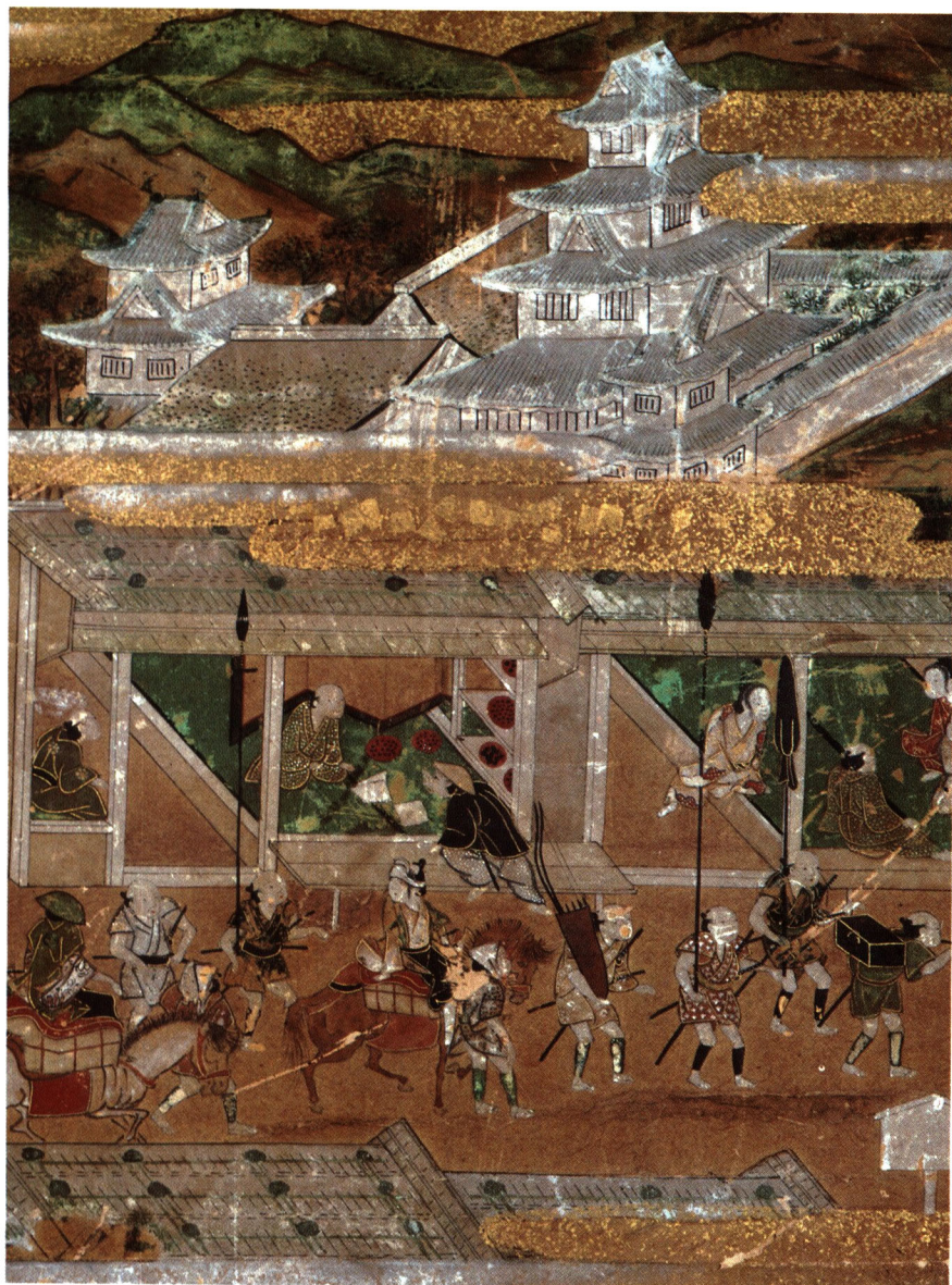
View of the castle town of Odawara on the Tōkaidō road, painted sometime before the Meireki era (1655–1658). (Sanbōin, Daigoji Temple, Kyoto)