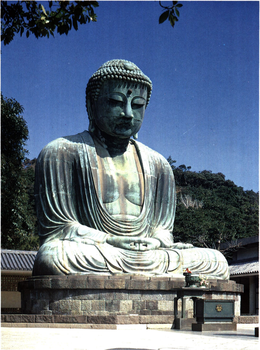
Monumental bronze sculpture of Amida Nyorai seated in meditation (The Great Buddha of Kamakura). (Kōtokuin Temple, Kamakura City)