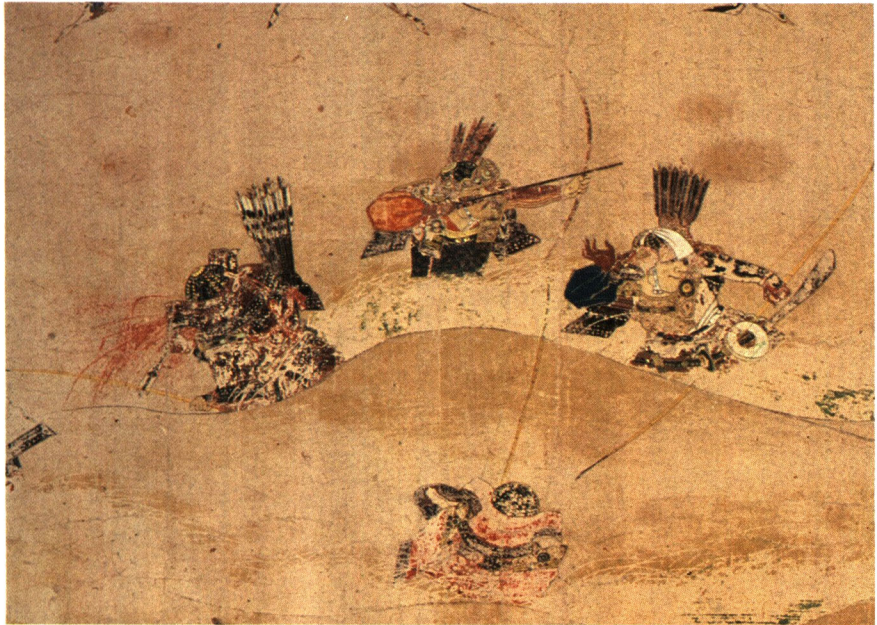
Warriors from Sagami in the heat of battle. From the Gosannen kassen ekotoba . (Tokyo National Museum)