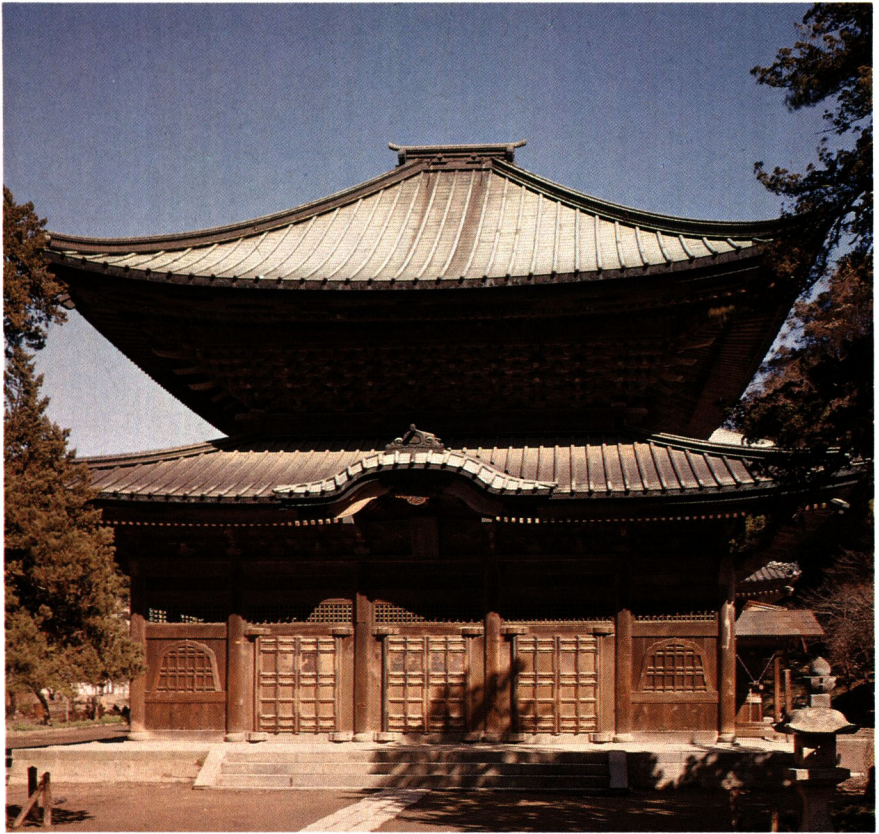
Buddha Hall of Kenchōji Temple, Kamakura City.